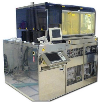
Nikon Stepper Exposure Tool