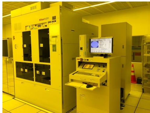
Dainippon Screen 80B Photoresist Coat and Develop Track – normally attached to Stepper