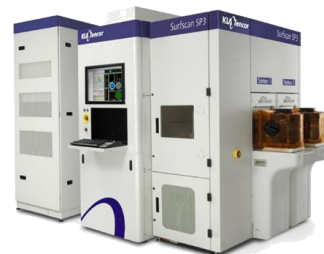
KLA Surfscan Inspection Tool